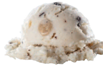
Cookie Dough Chip