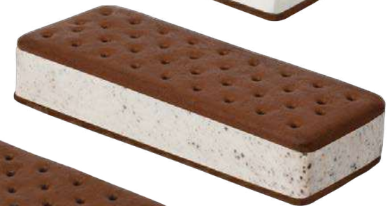
COOKIES & CREAM SANDWICH