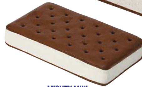
MIGHTY MINI SANDWICH