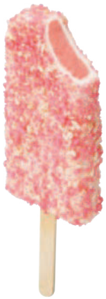
STRAWBERRY & CHOCOLATE SCOOTER BARS