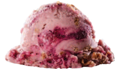
Super Berry Acai