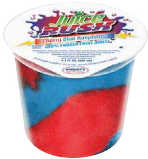
JUICE RUSH® CUPS